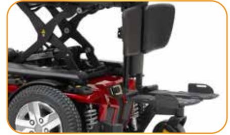
Swingaway legrests with angle adjustable foot plates or centre-mount footboard