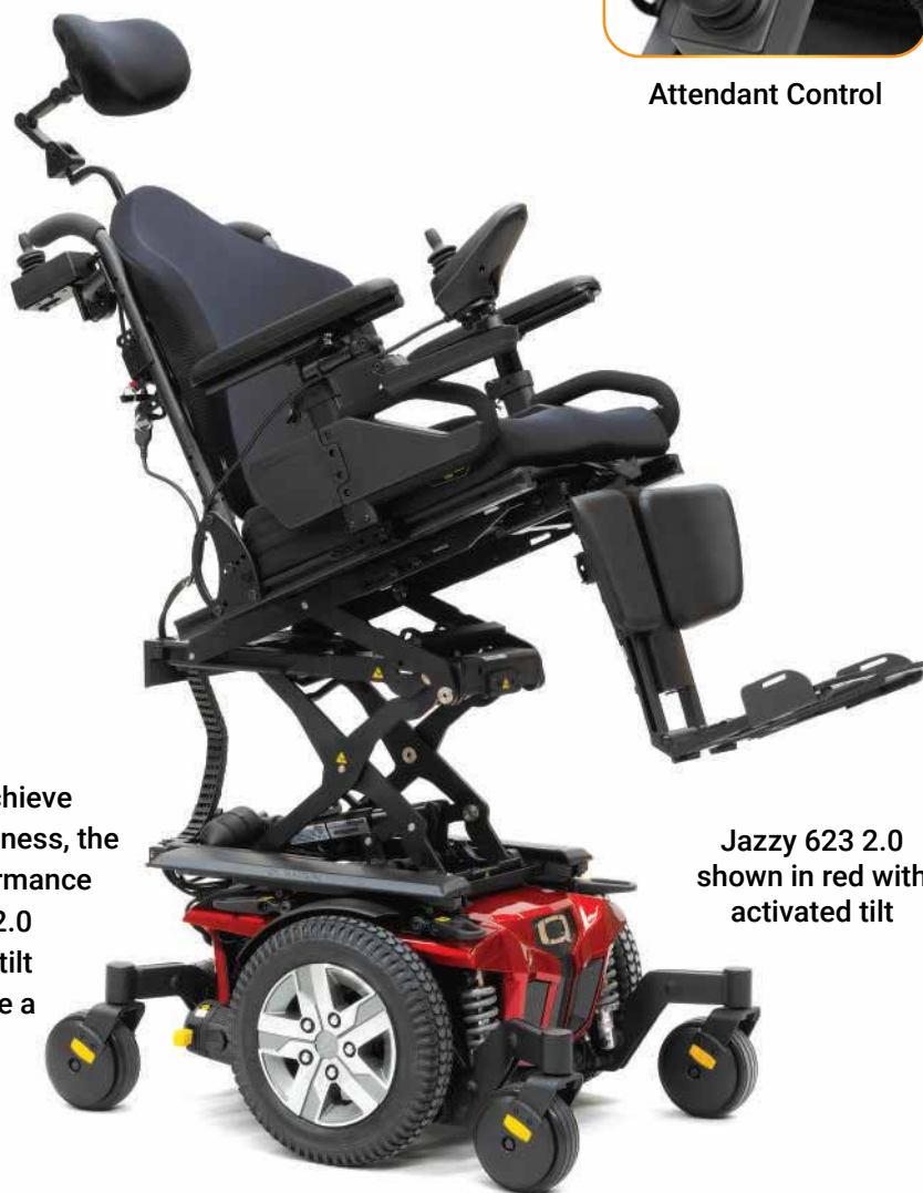
Jazzy 623 2.0 shown in red with activated tilt